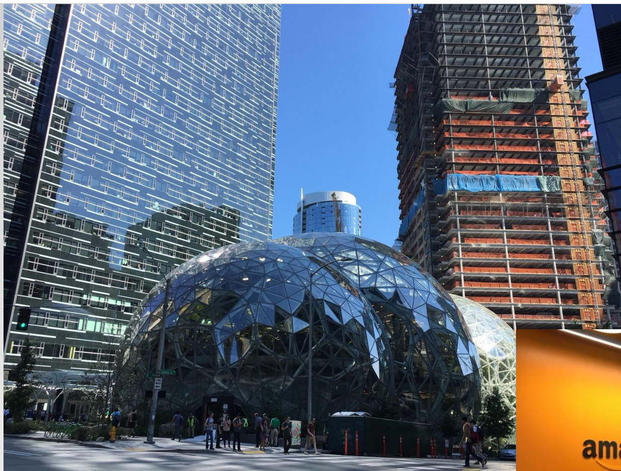
Photo of Amazon Sphere and Amazon HQ